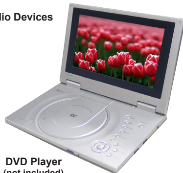
DVD Player (not included)